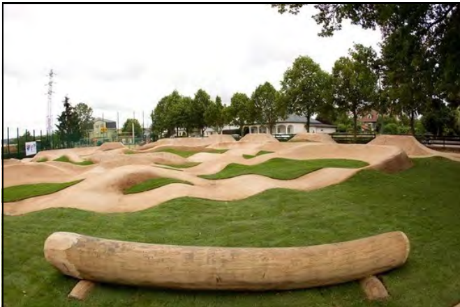
Pump Park Example