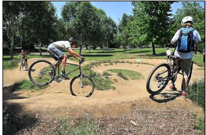
Pump Park in Action.