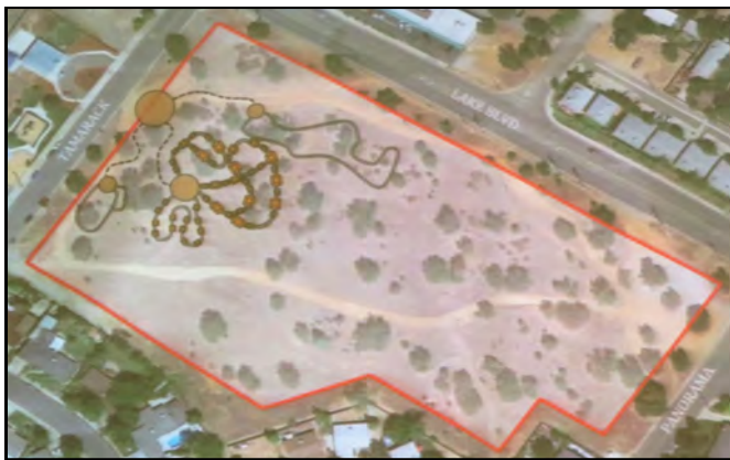
Schematic of Proposed Park at Lake Blvd. And Tamarac Road.