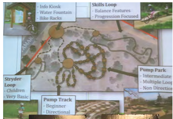
Schematic Details of the Proposed Pump Park

The only recognition for a very busy day at the recent meeting of The Rotary Club of Redding was for Mark Lascelles. Mark announced the GRAND OPENING of the Shasta Venture Hub. The recognition cost Mark $100. Check shastaventurehub.com