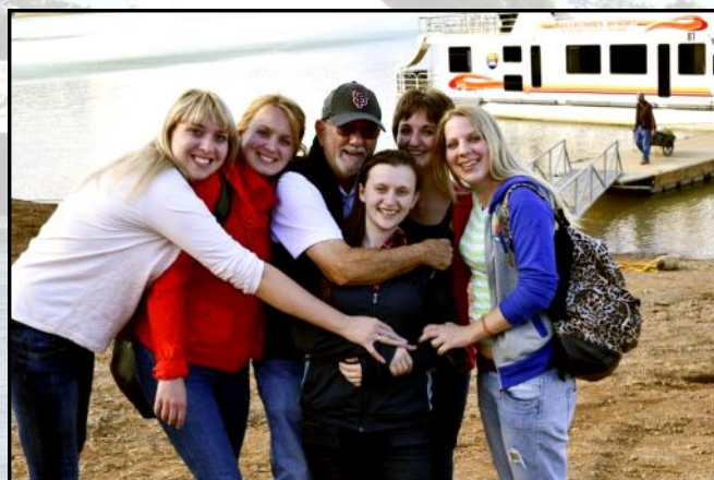
House boating at Shasta Lake