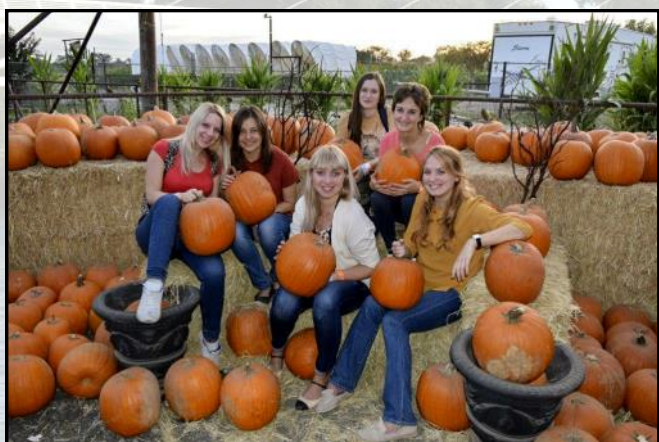
Playing at the pumpkin patch at Hawes Farm