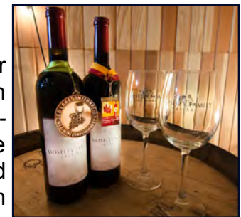
Silver Medal Winner