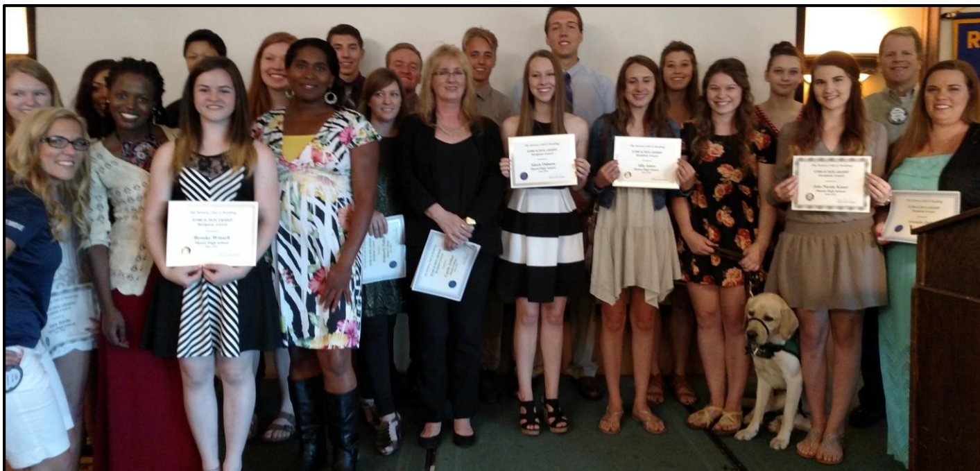
Congratulations to this year's Scholarship Winners