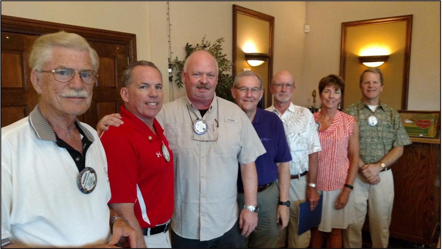
Today's Recipients of Paul Harris Fellowships