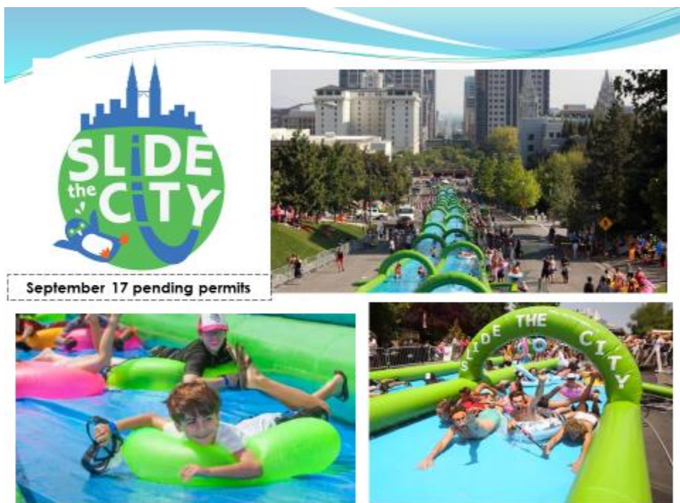
Slide The City