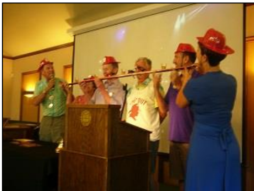
Get Ready and . . .