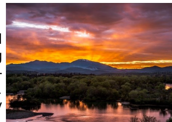
Sunset over Sacramento River in Redding.

All of these economic activities, no matter how substantive, produced an up and down business cycle which made everyone wonder when the next shoe was going to drop, to worry and rumor about an inevitable collapse which became self-fulfilling. Each new enterprise pulled down the architectural heritage of the past. Sense of community and shared relationships disappeared or were crushed by new arrivals or dismembered by those who departed for better opportunities.