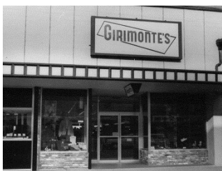
Apparel store on Market St.