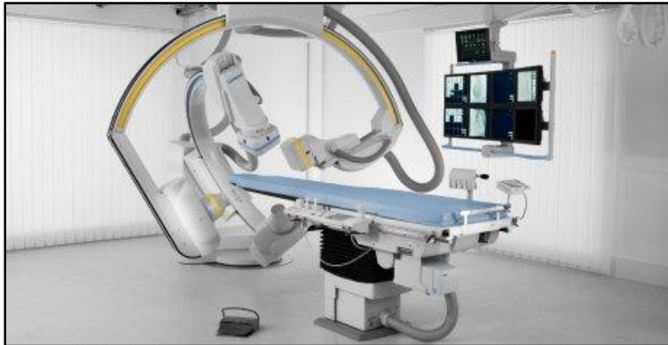
Bi-Plane Neuroangiography system

It allows treatment of stroke patients now in Redding without them having to leave the area. Prior to this technology being available, patients had to travel to Sacramento or the Bay Area for this level of care. Unfortunately, often the three or four hours of travel time meant that the patient had gone past the time where effective treatment was possible.