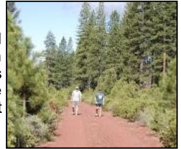
Great Shasta Rail Trail

These events are hosted by volunteers and feature a diverse array of adventures, typically on land that is not open to the public. That makes these excursions great opportunities for you to see beautiful private residences and secret spots that you normally wouldn't have the opportunity to enjoy.