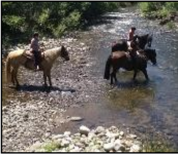
"Poker Ride" Wildways Event