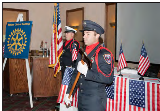
The colors were presented today thanks to the Redding Fire Department's color guard