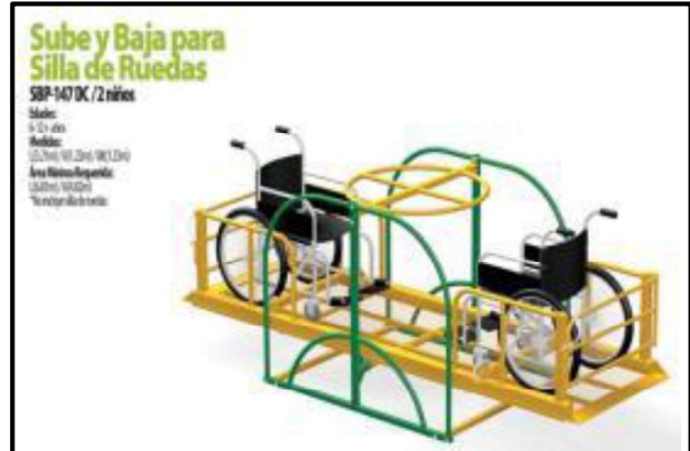
Wheel Chair Accessible Teeter-Totter