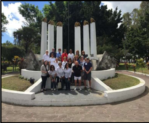
The Tres Amigas and their Rotarian comrades in Tepic, Mexico