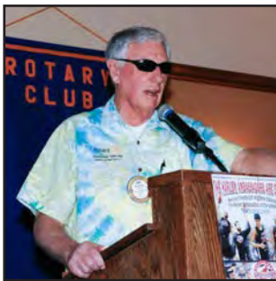
Our President... the future’s so bright