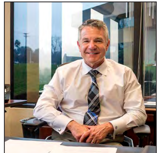
Senior Vice President at Morgan Stanley