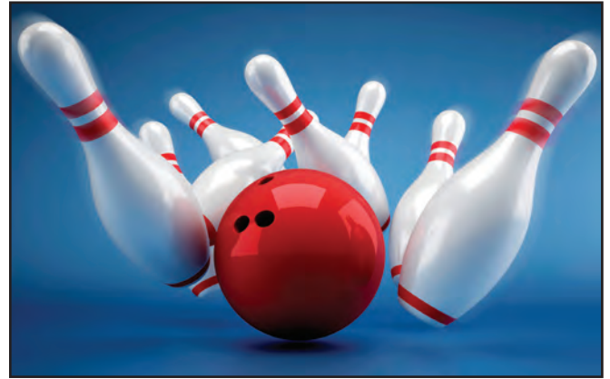
The Redding Rotary Bowl-A-Thon happens Saturday February 25th from 6:00 pm until 9:00 pm

The theme is "70's Tie-Dye", should be a blast!