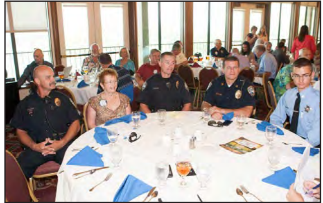
Some of Redding's finest were our guests today