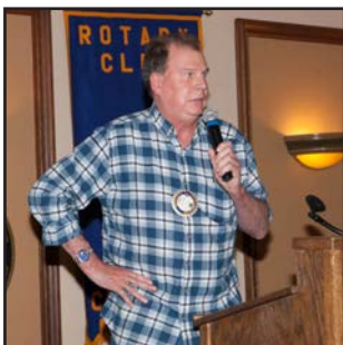
Our President... leading things off...