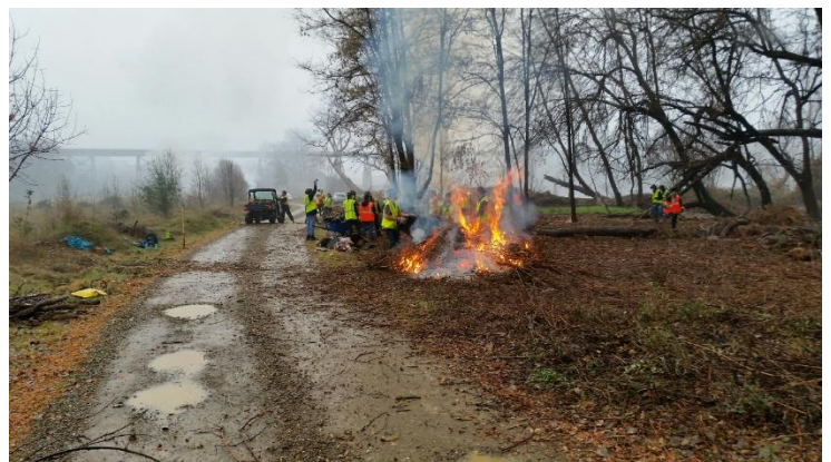
One of the many slash piles burning

Stream Team Update: The following is an account of one of the many cleanup and restoration projects that Rotarian Randy Smith has done. He has the ability to attract and organize habitat restoration projects that open up the accesses to the Sacramento River that haven't been available for decades.