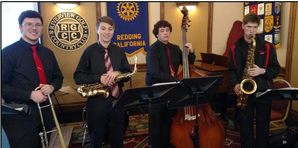
Club Cougar Jazz Band from Foothill High School

Before the meeting we were entertained by the Foothill High School Club Cougar Jazz Band. They were great. See next page for more information.