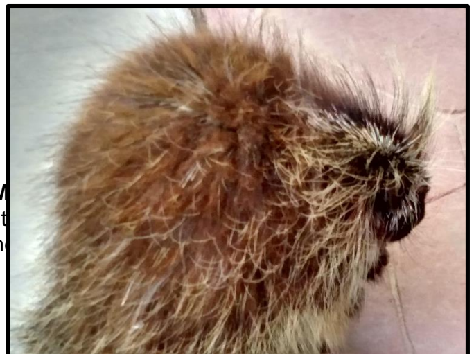
Spike the porcupine