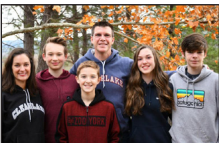
With the Poole family