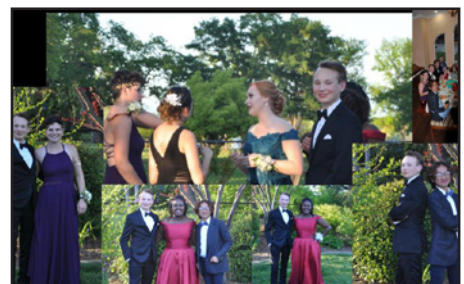
Prom time at Foothill High