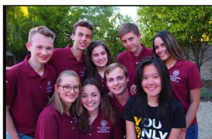
With other Rotary exchange students in our area