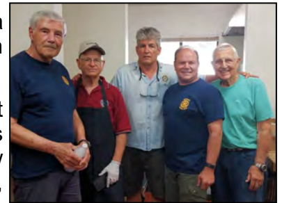
Rotarians at work!