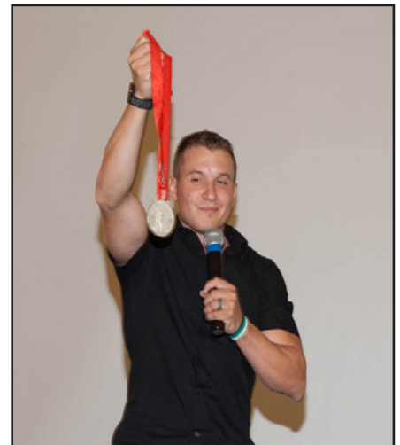
Olympian and American Ninja Warrior Jonathan Horton

Jonathan gave a great motivational presentation about how he repeated a cycle of going from failure to success and back again several times during the course of his competitive career, eventually becoming a twice-medaled gymnastic Olympian, and the team captain of the US Olympic Gymnastic Team.