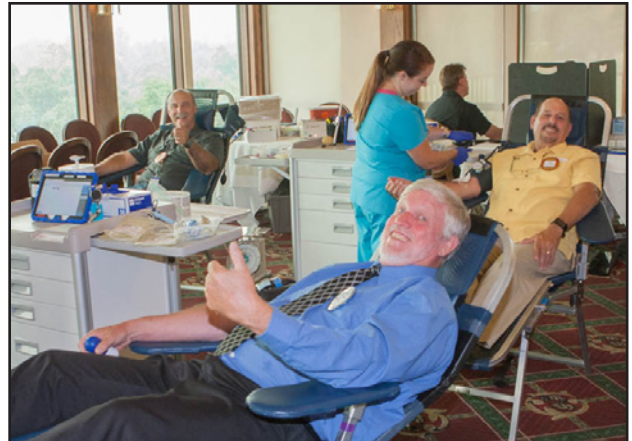
Blood drive day: three of Rotary Club of Redding's finest are pictured making a life-giving donation.

Larry Olmstead announced that a relief fund has been established to assist victims of the Carr Fire. Donors can go here to make a tax deductible contribution: https://app.mobilecause.com/fl1xpb/n . For more details, please see the press release included with this Spillway.