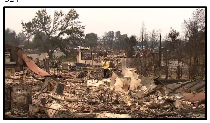
Awaiting debris removal

tons, of metals, ashes, soil, and concrete have been removed.