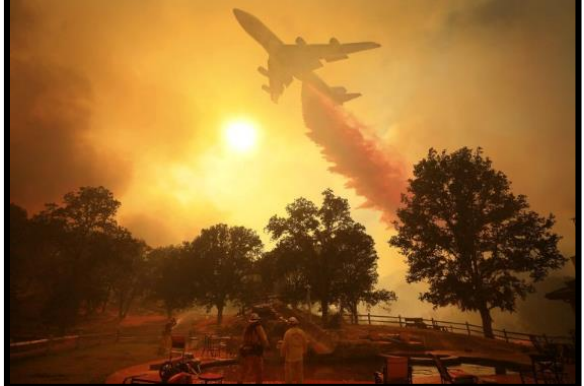
Aircraft dropping retardant

and many others worked tirelessly to provide support, ensure safety, and to keep the city running as normally as possible.