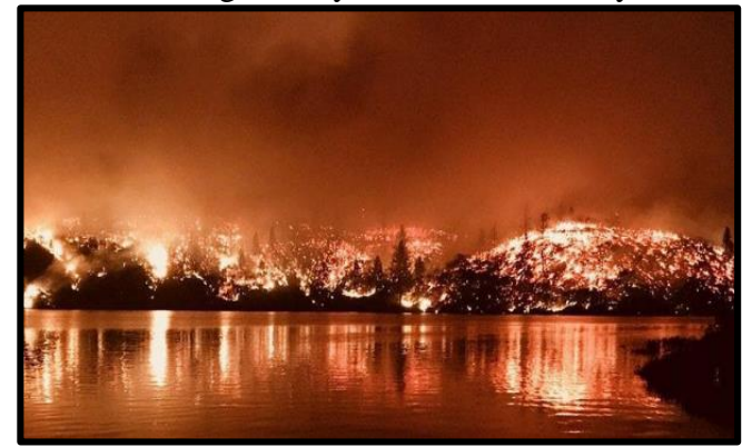
Fire On Both Sides of the River

Many City of Redding departments worked to support the efforts, Redding Police, Public Works, Water Utility,