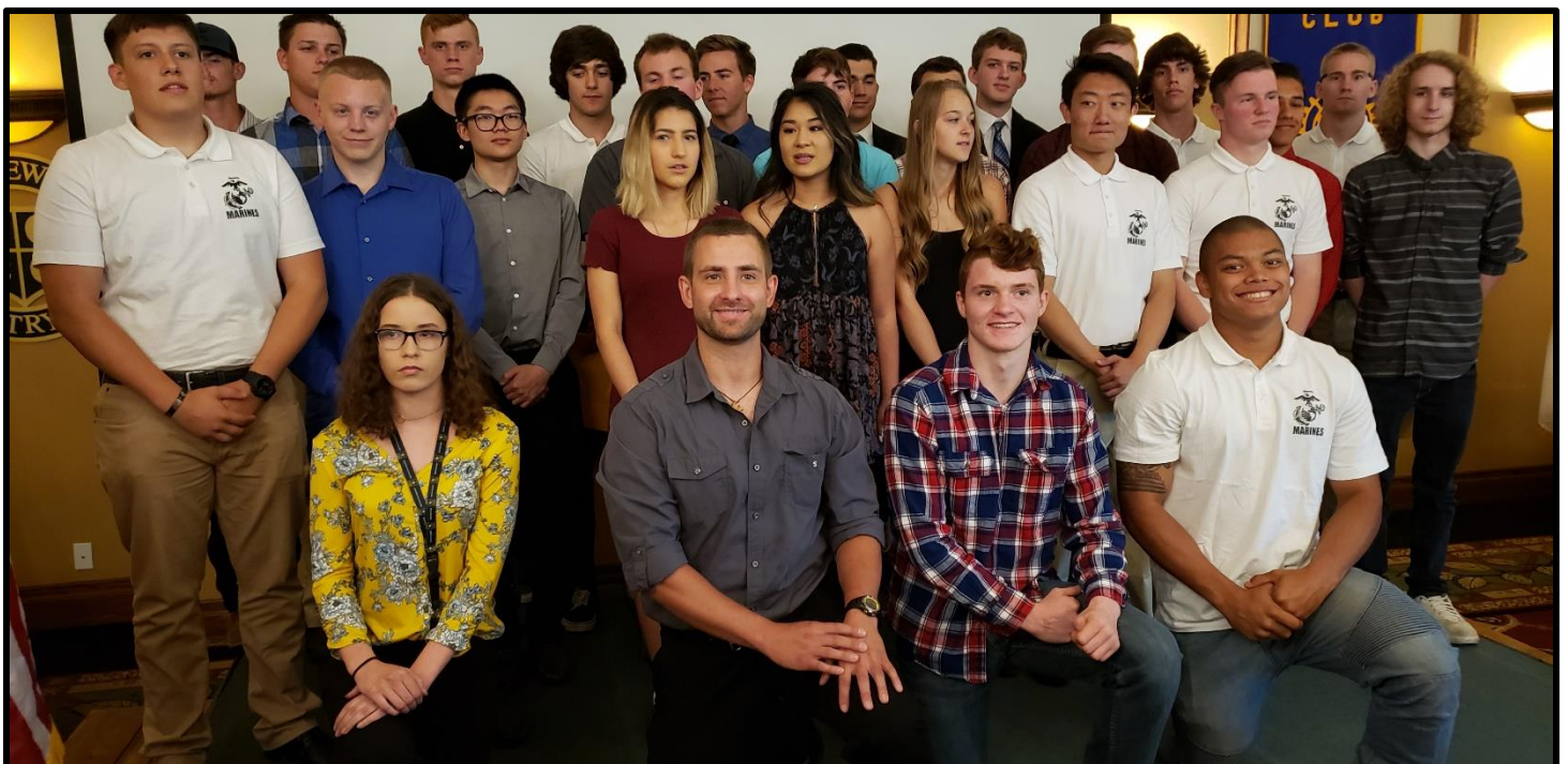
Congratulations to the 2019 Recruits from Northstate Schools

This year we had students from the following schools: Anderson High School (7), Central Valley High School (2), Enterprise High School (11), Foothill High School (3), Mercy High School (1), North Valley and Oakview High Schools (2), Pioneer High School (2), Shasta High School (11), Trinity High School (2), University Preparatory (3), West Valley High School (8).