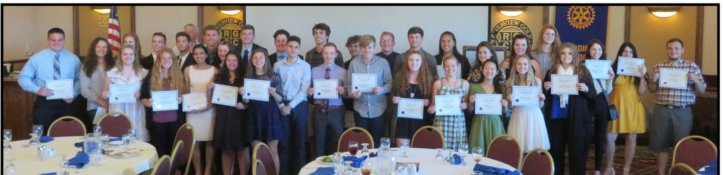
Here is the group picture of our Redding Rotary scholars