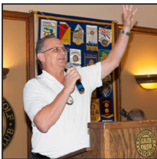
Our President... leading things off...