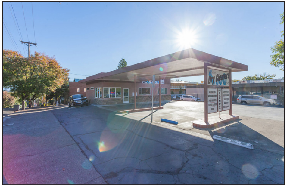
Pine Street Cleaners on the corner of Pine & South St.

Teresa manages day to day operations at Pine St. Cleaners and is proud of the services they have to offer. A visit to Pine St. means you get access to Drive-Up service, an after-hours drop bin, Dry Cleaning and Shirt Laundry, Wedding Gown Preservation and Restoration and well as specialty clothing care.