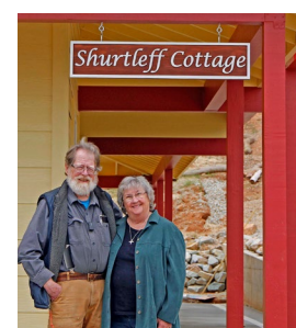
A new sign for a new home, "Shurtleff Cottage".