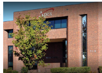
New Home of the Lassen Park Foundation Office