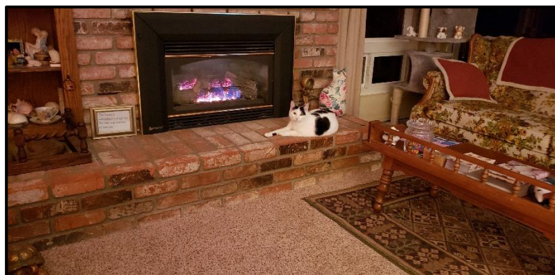
How To Spend A Rainy Day