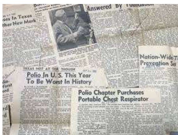
COVID-19 Not the First Epidemic

And you thought Rotary's END POLIO NOW was just about polio. Stay safe.