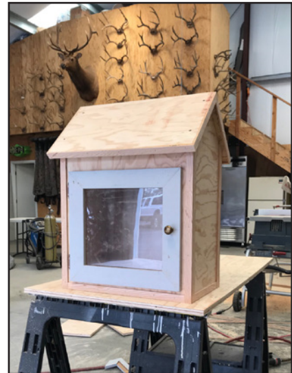
Pat Corey's Little Library