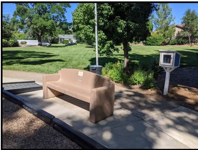
Our library box installed at Rolling Hills Park, 3090 Oro Street. Good work library box team.