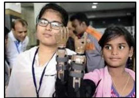
Two LN-4 Recipients

The LN-4 is an artificial hand that has been distributed throughout the world. Our club has made several international trips to distribute the hands over the last 10 or so years. Well done.