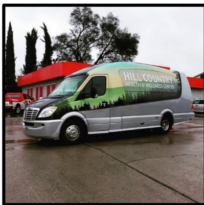
Mobile Crisis Van

As they noticed many patients from Redding coming to Round Mountain for care, they expanded to Redding.