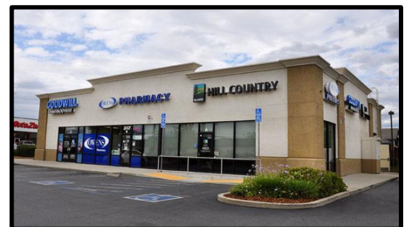
Lake Blvd. Clinic

It is a great resource for the Inter Mountain area.