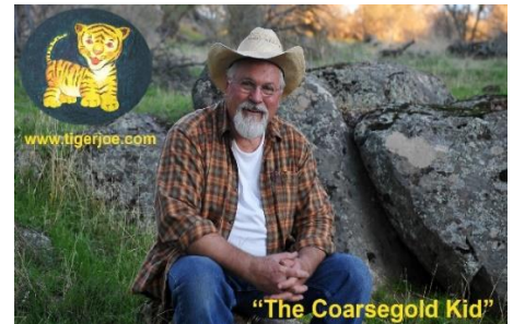
"The Coarsegold Kid"