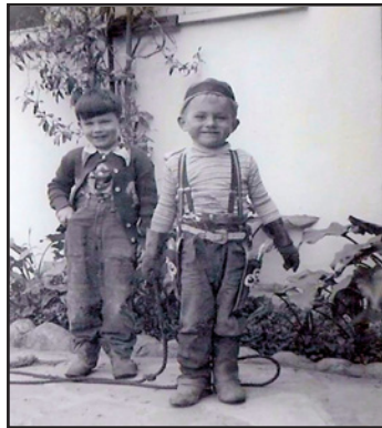
An adorable young Tiger (on the right)