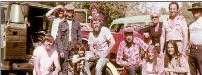
Tiger (far left) with the neighborhood "gang"