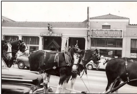
A view of one of the family's early businesses, The Coach & Horse with the Clydesdales