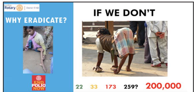
Some sobering projections of possible polio cases if more is not done soon.