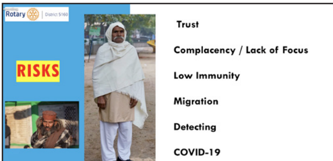
Some risks and challenges to completing the task of polio eradication