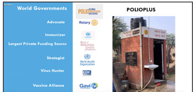
A closed-loop sanitary system built by Rotary