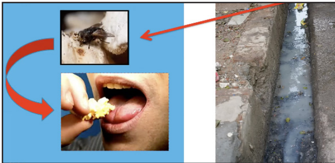
A illustration of how polio is transmitted in developing countries, from open sewers to the human food chain.

The following are some slides shared today by our speakers: