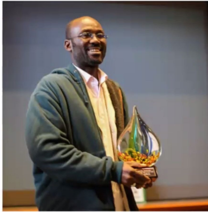
VISIONARY OF THE YEAR