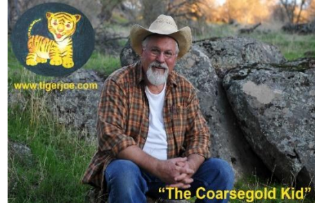
"The Coarsegold Kid"