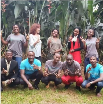
PEACE PRACTICE ALLIANCE