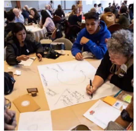
WORKSHOPS AND EVENTS