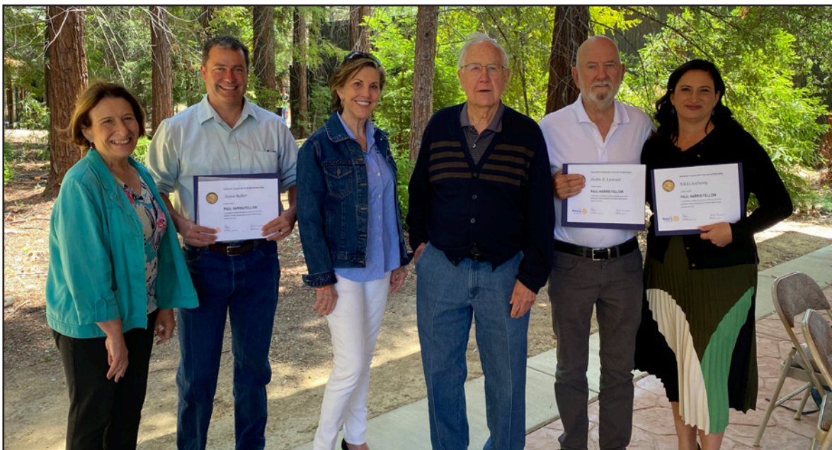
Our Paul Harris Honorees