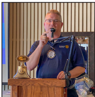
Pres. Joe running the show