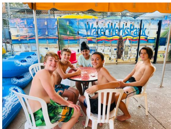
Future Rotarians take a breather from Hi-intensity sliding.