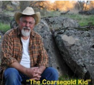
"The Coarsegold Kid"