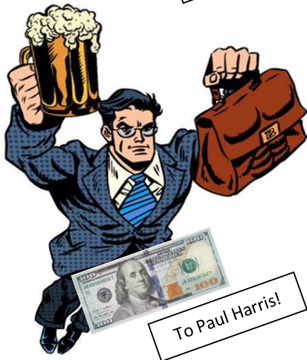
To Paul Harris!