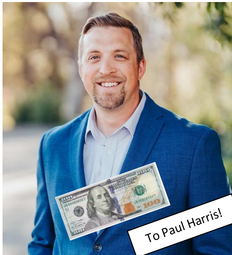
To Paul Harris!