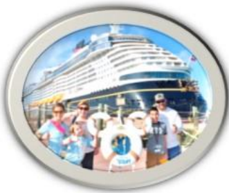
NIFTY FIFTY WITH MICKEY