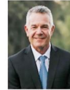
CA License #: 0837056

The Pathfinder Group at RBC Wealth Management