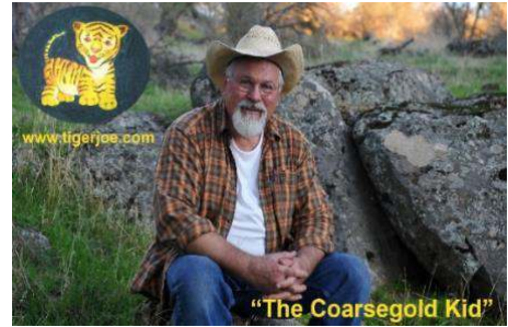
"The Coarsegold Kid"

Entertainment - Lunch - Dinner 221-2335 Web Site Click HERE