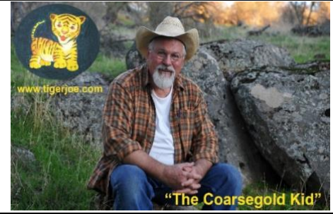
"The Coarsegold Kid"

Entertainment - Lunch - Dinner 221-2335 Web Site Click HERE