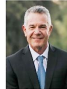
CA License #: 0837056

The Pathfinder Group at RBC Wealth Management