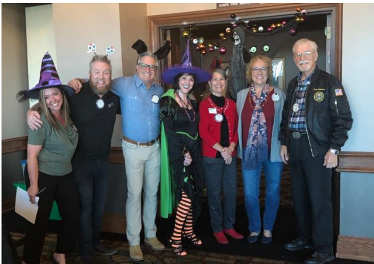
Team 8 gets into the spirit.