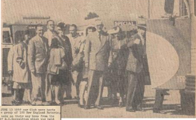
On June 13, 1947 our Club played host to a group of 100 New England Rotarians on their way home from the 1947 RI Convention held in San Francisco (image left.)