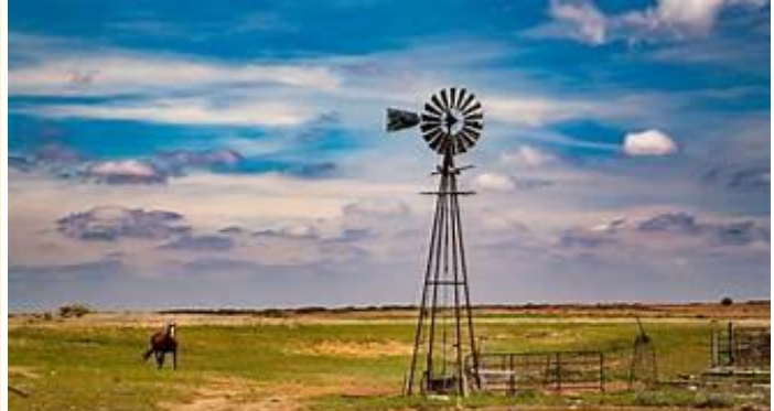
Oklahoma is OK! However, it is flat!