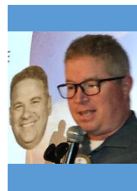
Invocation & Sunshine