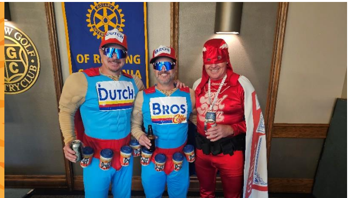
Caffeinate with a Cause Video – Dutch Bros.

https://drive.google.com/file/d/1kLMY72lQrAwvaYvwm7hm7u-obfm3D6nE/view?usp=sharing