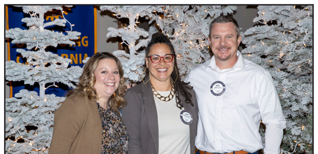
Enterprise High Link Crew