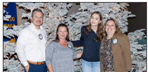
U Prep Interact Club