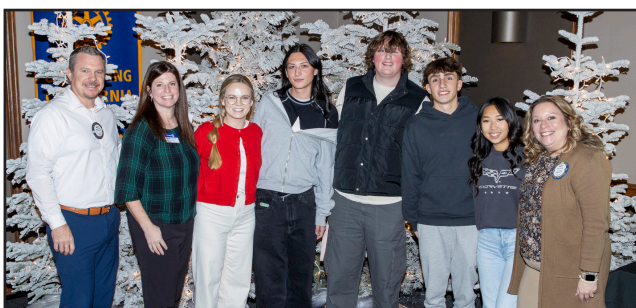
Anderson High Leadership