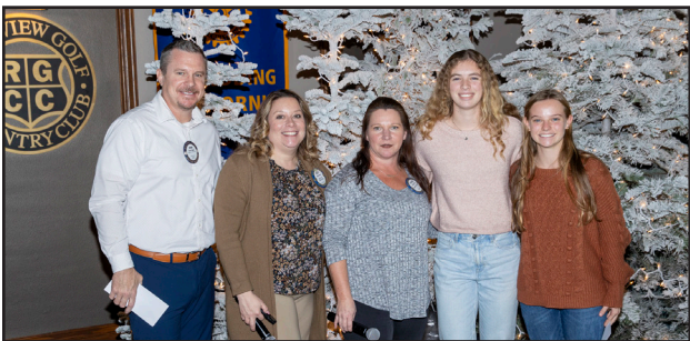
U-Prep Class of 2025