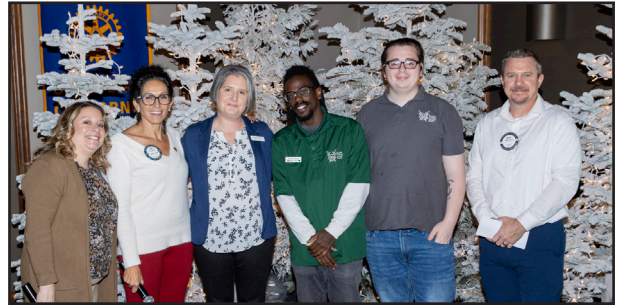
Shasta College Student Senate