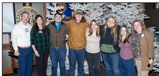
Anderson High Future Farmers of America