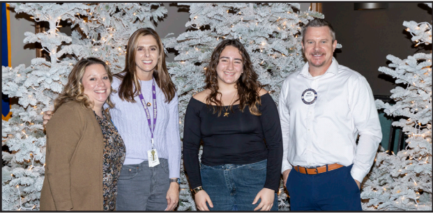
Shasta High Interact Club