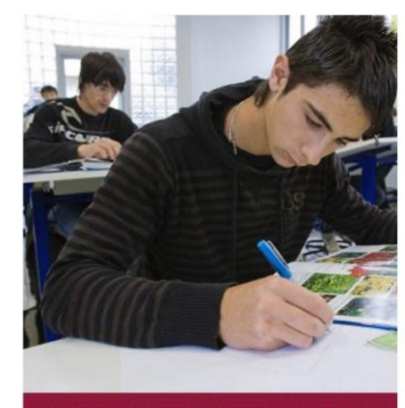
WE ARE OPPORTUNITY-CREATORS

We connect passionate people with diverse perspectives to exchange ideas, forge lifelong friendships, and, above all, take action to change the world.