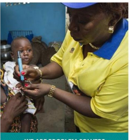
WE ARE PROBLEM-SOLVERS

Rotary members look for opportunities to improve our communities today and invest in the next generation for tomorrow.