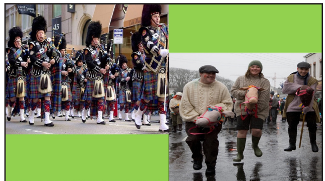
Kilts and woolly jumpers!