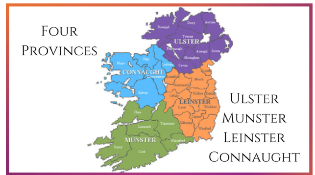
Northern Ireland, Colin's home country, is located in the Ulster Province