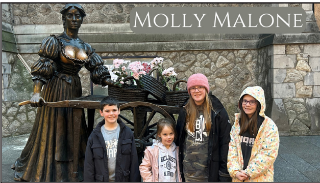
Ireland's most famous fishmonger with Colin's kiddos